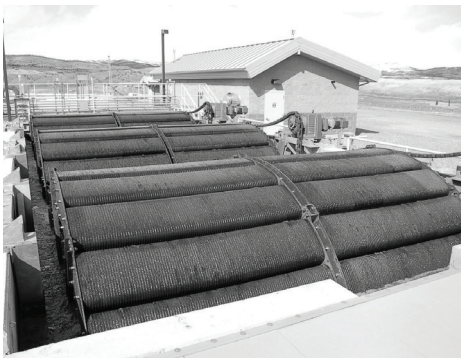
Town of Manhattan, Montana, USA 1,515 m 3 /d (278 gpm) Montana Grand Project Award winner