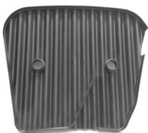
Corrugated plastic plate