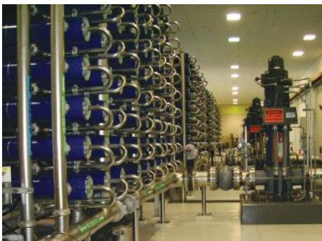
City of Cape Coral, Florida, United States

H2O Innovation designs, builds and commissions RO and NF systems for various applications and of different flow rates. The company's multidisciplinary teams have extensive water treatment knowledge and work closely with industry leaders to design appropriate systems with pertinent parts and features.