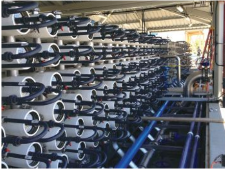
Leo J. Van der Land, California, United States

The selection of the appropriate membrane technology amongst the various element types is strongly influenced by the raw water source, the application, the required treated water quality, and, sometimes, the associated operating and maintenance costs. Though NF and RO use different membranes, they operate the same way: water is forced through the semi-permeable layers of the membranes leaving behind the dissolved minerals, suspended solids and bacteria. Both systems will include feed pumps, piping, and valves. Only a portion of the feed water entering the NF or RO membrane system is turned into clean water. The portion of water that passes through the membrane pores is collected by the core tube to reach the next treatment step is called permeate. The portion of water exiting the system containing the minerals and other contaminants rejected by the membrane is called concentrate.