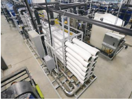
City of Winkler, Manitoba, Canada

The selection of the appropriate membrane technology amongst the various element types is strongly influenced by the raw water source, the application, the required treated water quality, and, sometimes, the associated operating and maintenance costs. Though NF and RO use different membranes, they operate the same way: water is forced through the semi-permeable layers of the membranes leaving behind the dissolved minerals, suspended solids and bacteria. Both systems will include feed pumps, piping, and valves. Only a portion of the feed water entering the NF or RO membrane system is turned into clean water. The portion of water that passes through the membrane pores is collected by the core tube to reach the next treatment step is called permeate. The portion of water exiting the system containing the minerals and other contaminants rejected by the membrane is called concentrate.