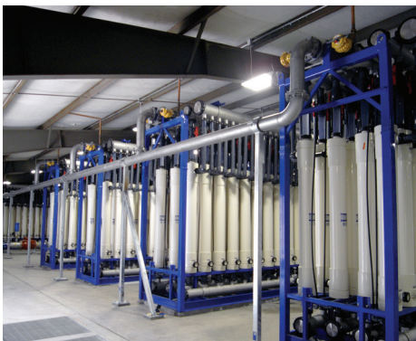
Clifton - Municipal Wastewater