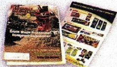
Magazines, brochures & catalogs