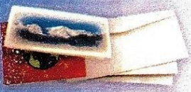
Opened mail & greeting cards

You can now place all recyclables in one bin!