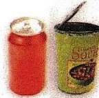
Cans (do not crush or flatten)