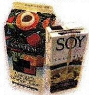
Paper milk/ juice cartons (no foil pouches, do not flatten)