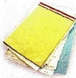
White or pastel office paper