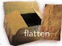
flatten Corrugated cardboard & paper bags