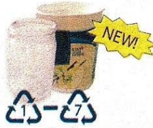
#1-7 Plastic tubs & screw-top jars (no lids, no #7 PLA compostables, do not flatten)