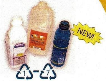
#1-7 Plastic bottles & jugs (no lids, no #7 PLA compostables, do not flatten)