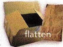
flatten Corrugated cardboard & paper bags